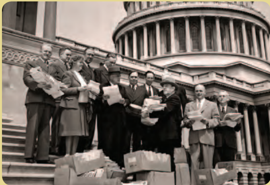
Legionnaires and members of Congress stand on the steps of the Capitol with letters and petitions in support of the Servicemen's Readjustment Act of 1944. Created by The American Legion it became known as the GI Bill, enabling millions of veterans to live the American dream.

In 1921, just two years after the formation of The American Legion, the new organization won a major victory when the U.S. Veterans Bureau, a forerunner of the Veterans Administration, was created. While the new agency was far from perfect, it did codify the government's commitment "to care for him who shall have borne the battle..."