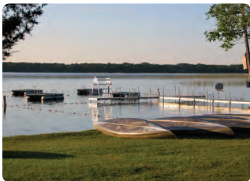
Boats and canoes await eager campers at North Long Lake.

What makes Camp Legionville successful is that it is pro-active. It is often the news that you don't hear, the child who isn't hit by a car or the swimmer that doesn't drown that is evidence of a program's success.