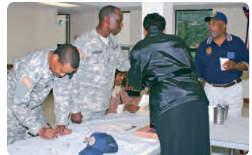
(bottom right) Post 915 sponsors a homecoming event for returning deployed servicemembers.