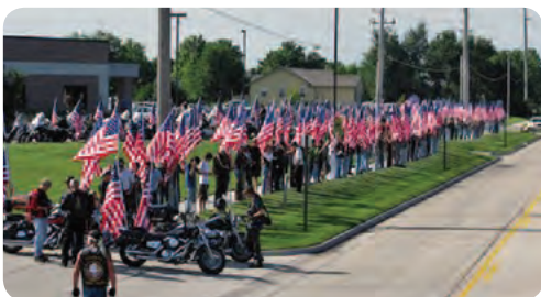
Day or night, the Patriot Guard is there to salute the fallen.