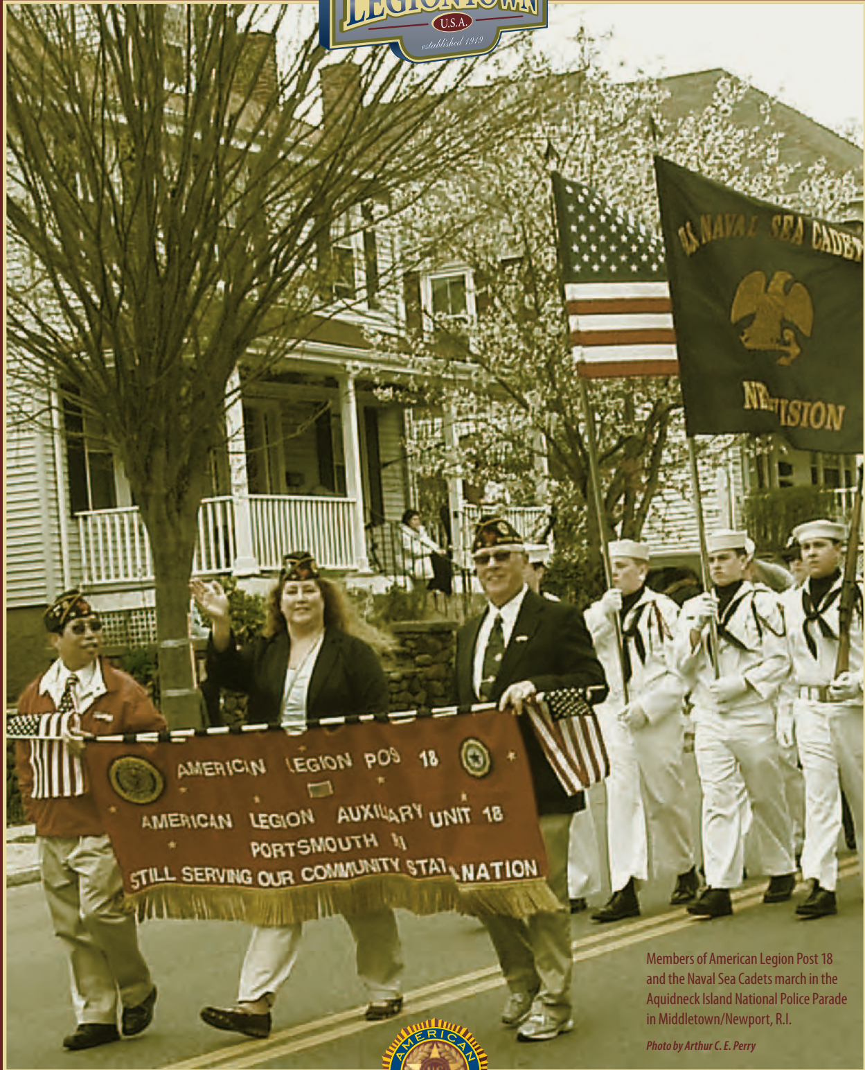
Members of American Legion Post 18 and the Naval Sea Cadets march in the Aquidneck Island National Police Parade in Middletown/Newport, R.I.