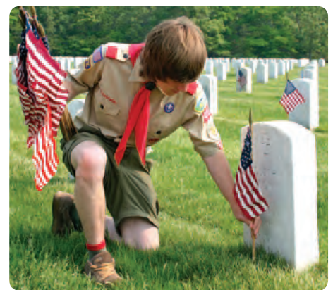
A Boy Scout places a flag on a grave at Calverton National Cemetery.