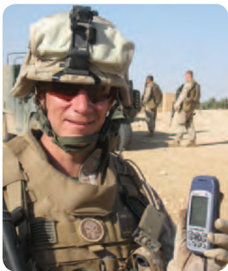
A Marine in Iraq displays his GPS device provided by Operation Waypoint.

To donate or learn more about Operation Waypoint, visit www.gpsfortroops.org .