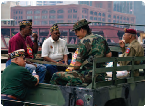
(above) Post members participate each year in Chicago's Memorial Day Parade.