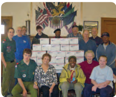
Troop 3 assisted the Dept. of Illinois’ 7th District with sending care packages to Iraq.