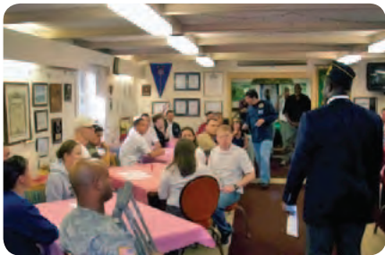
American Legion Post GR01, Department of France, provides quarterly dinners for wounded soldiers recovering at Landstuhl Regional Medical Center.

Just as the U.S. military performs magnificently abroad, Post GR01 proves that overseas Legionnaires can turn international communities into Legiontowns.