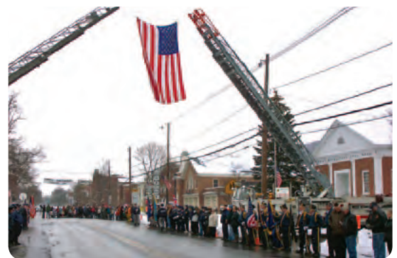
Homer residents await the start of the annual Memorial Day parade.

Whether it's through its support of the town's Cub Scouts and other youth programs, or the sponsorship of Civil War reenactments, Post 465 is a shining example of a Legiontown, USA.