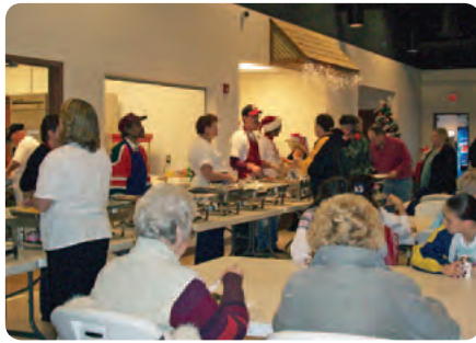
Members of Post 96 serve Christmas dinner to needy families.

Bringing the spirit of the season with generosity to the community is the core focus of the annual Christmas dinner held at Post 96 in Lima, Ohio.