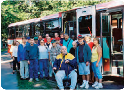
(above) Campers begin their journey at Camp American Legion.