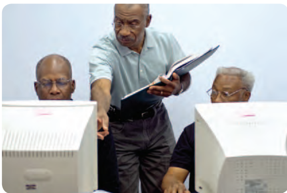
Veterans receiving instruction during a class at the Internet café.

To learn more about career fairs or issues pertaining to veterans' employment, visit www.legion.org or www.recruitmilitary.com .