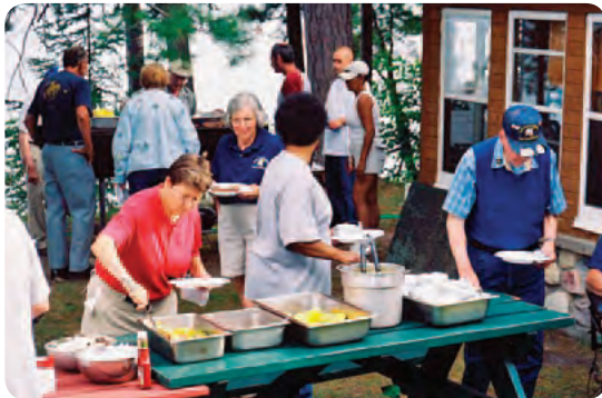
(below) Campers gather around the picnic tables and grill to enjoy a feast fit for the great outdoors.