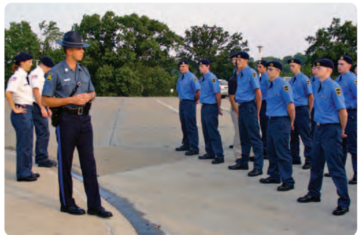
Cadets at the Missouri Cadet Patrol Academy receive a wide range of instruction from law enforcement professionals.